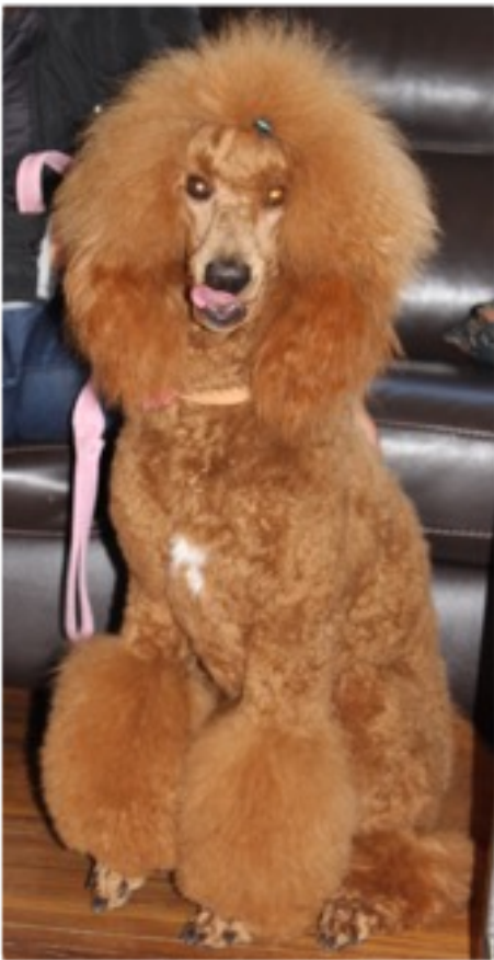
KAIYA - Dam