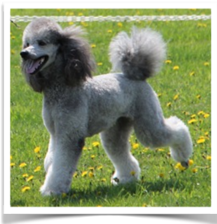
JEWELS - Dam