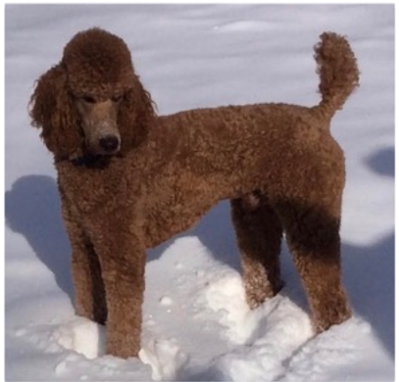
RYDER - Sire

Puppies ready for their new homes mid May 2018