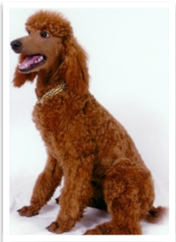
ROSIE - Dam