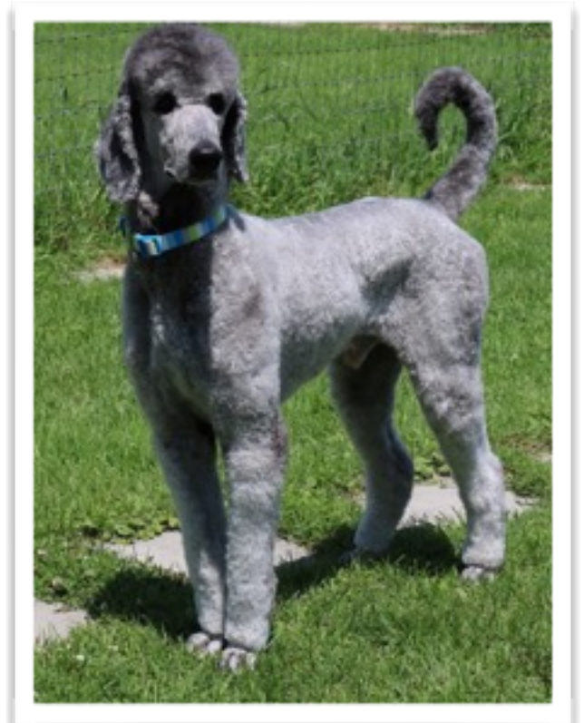
SANDLER - Sire

Puppies ready for their new homes end of May 2018