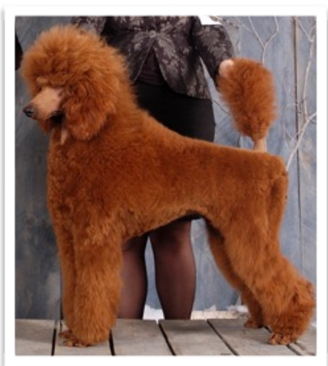
EMBER - Dam