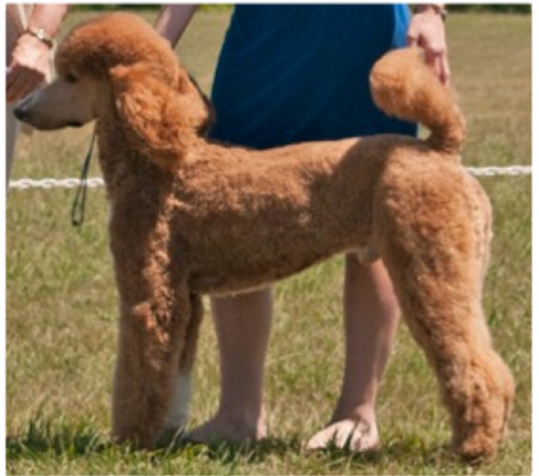
HOBBS - Sire

Puppies ready for their new homes mid May 2018