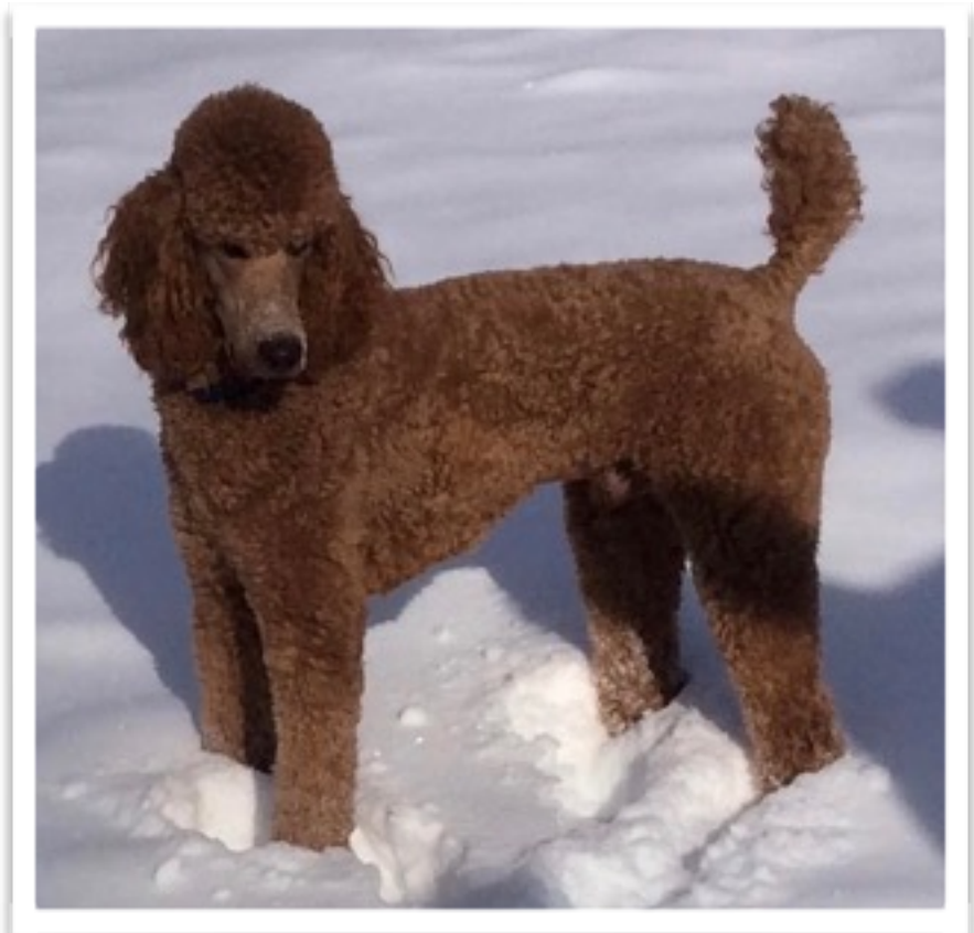
RYDER - Sire

Puppies ready for their new homes end May 2018