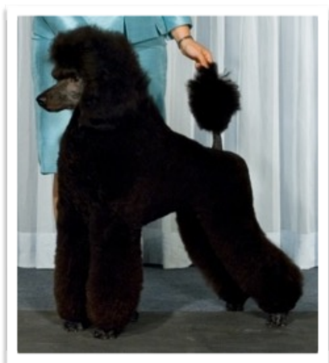
SOPHIA - Dam