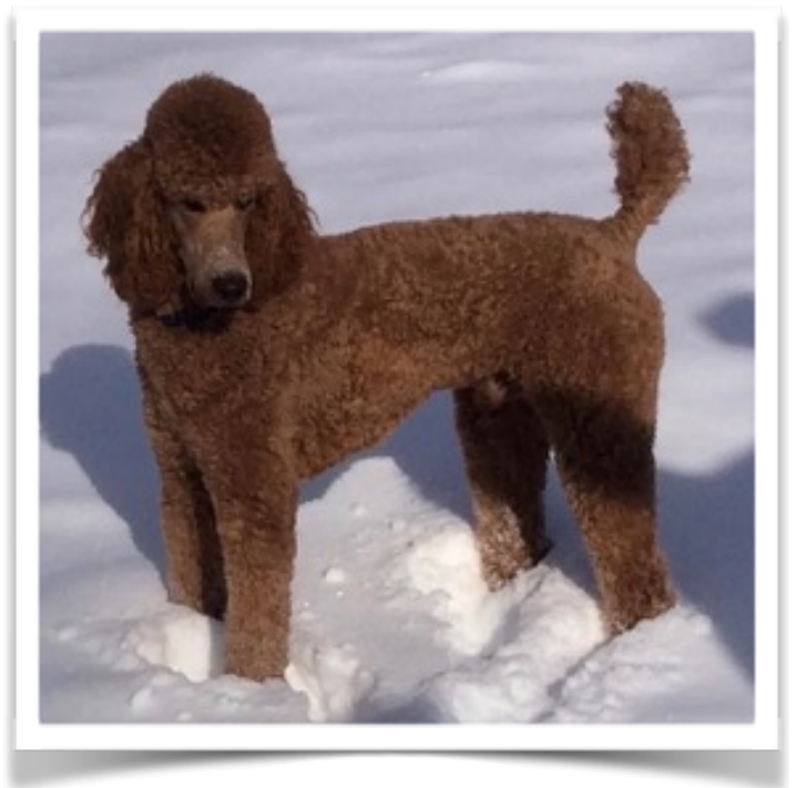
RYDER - Sire

Puppies ready for their new homes mid June 2018