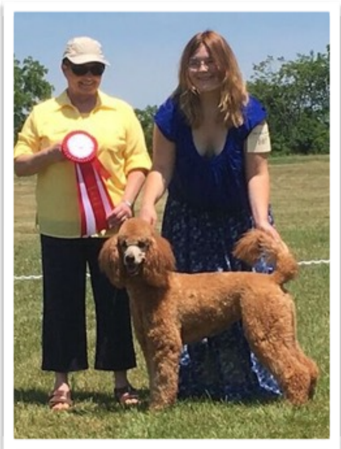
SCARLET - Dam