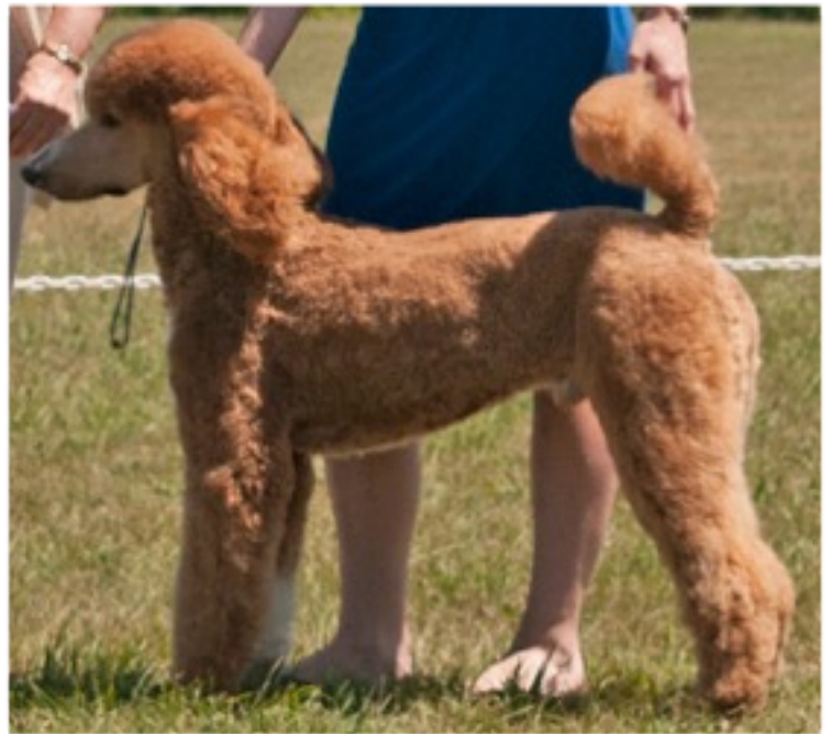
HOBBS - Sire

Puppies ready for their new homes mid May 2018