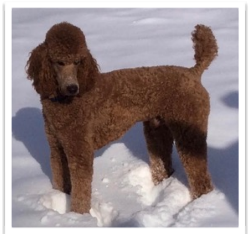
RYDER - Sire

Puppies ready for their new homes end May 2018