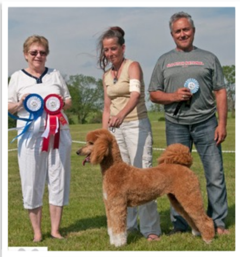
BECCA - Dam