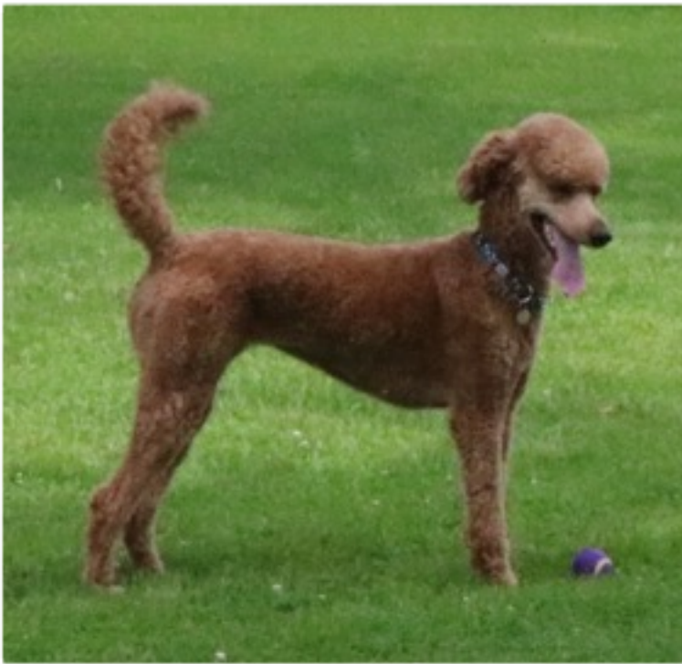
ROSIE - Dam

PUPS ANTICIPATED TO ARRIVE Approximately early September 2018 Average Adult Size 40 - 50 pounds