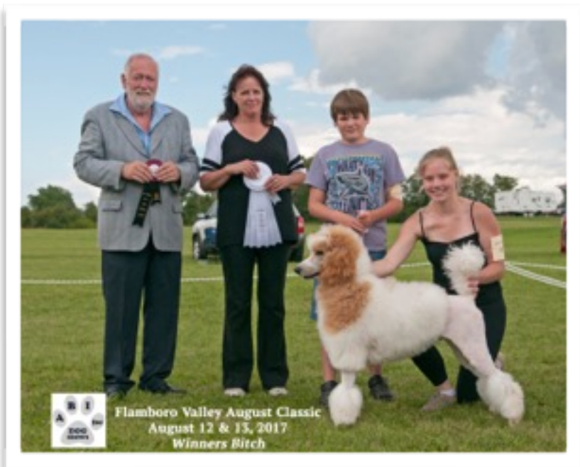
JAZZ - Dam

PUPS ANTICIPATED TO ARRIVE Approximately mid September 2018 Average Adult Size 40 - 50 pounds