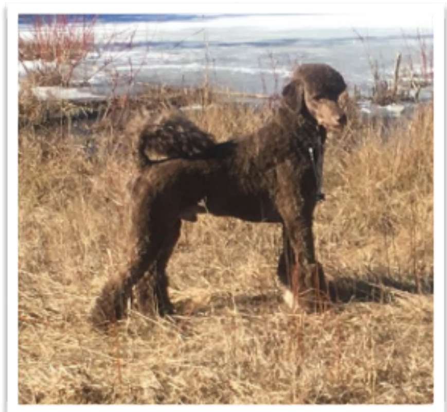
ROMAN - Sire

Puppies ready for their new homes mid November 2018