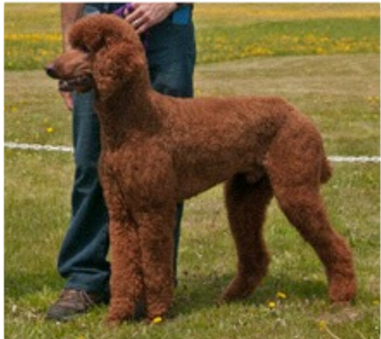
RUSTY - Sire

Puppies ready for their new homes end November 2018