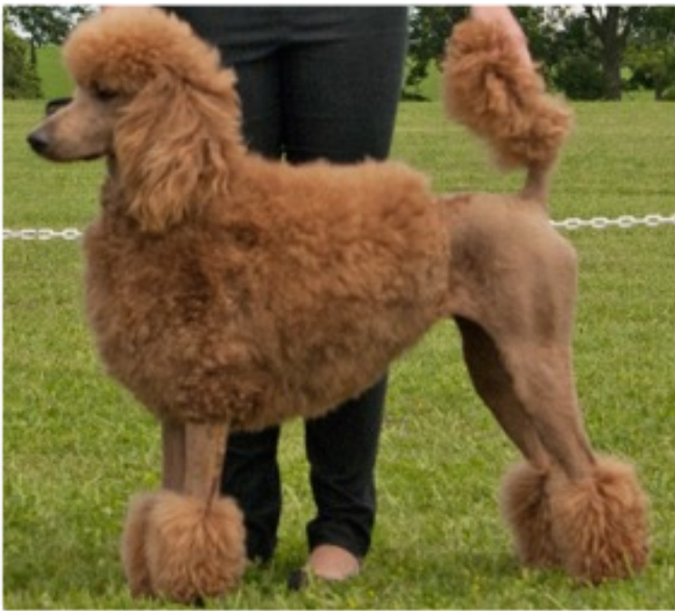
RUBY - Dam