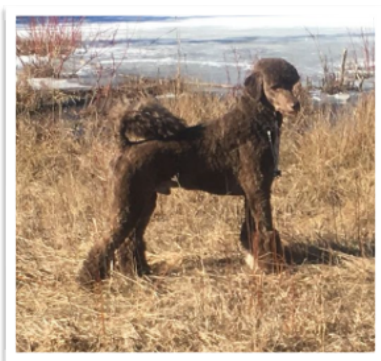
ROMAN - Sire

Puppies ready for their new homes mid September 2018