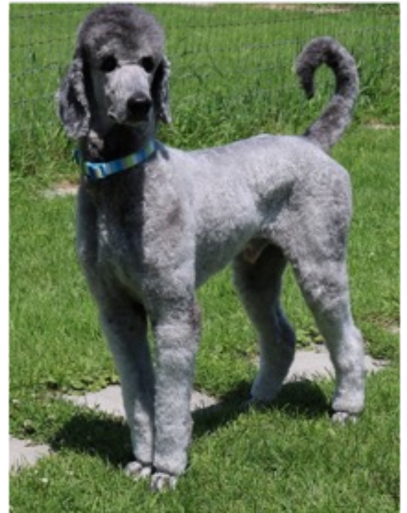
SANDLER - Sire

Puppies ready for their new homes end of September 2018