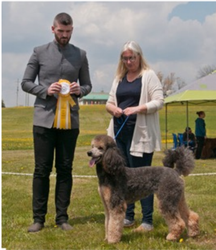
SCOUT - Dam