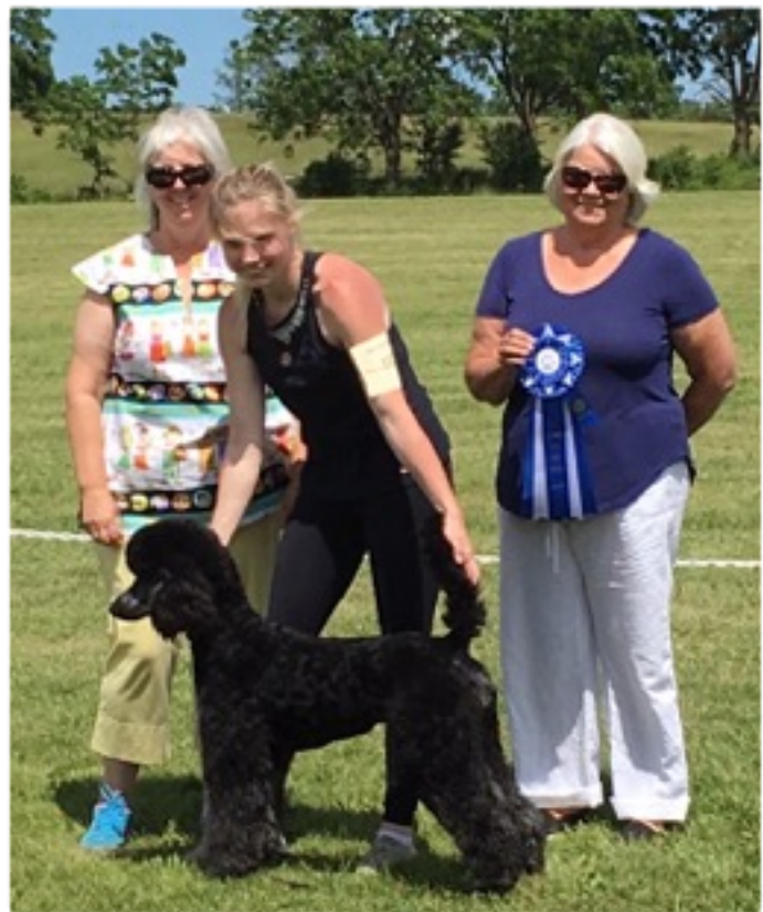
ROCKET - Sire

Puppies ready for their new homes mid October 2018