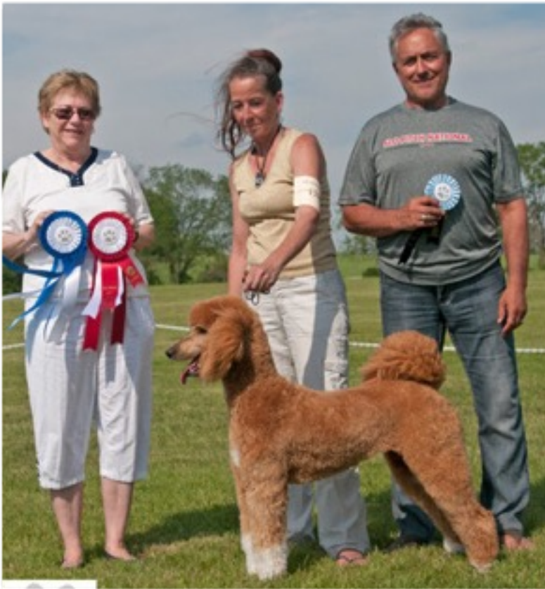
BECCA - Dam