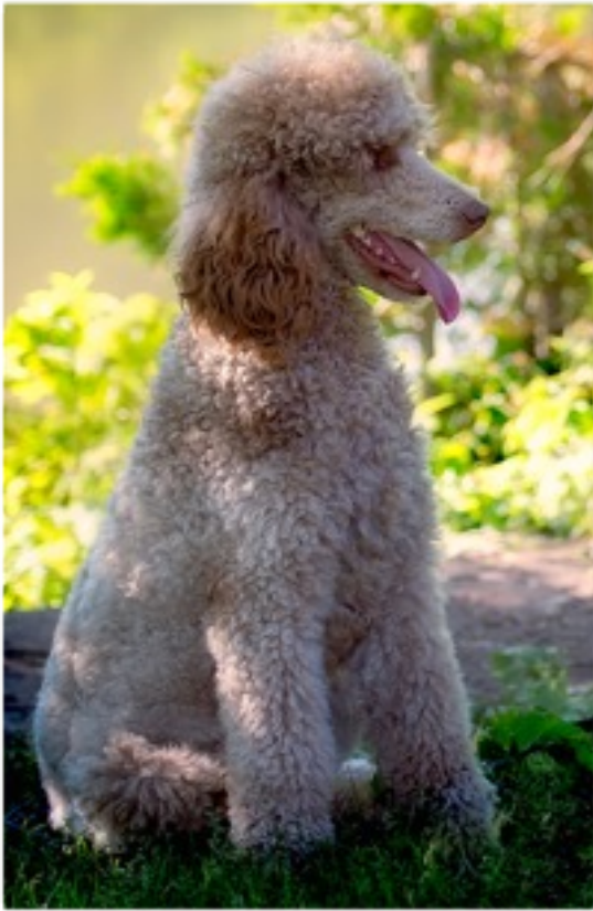
PEPSI - Dam