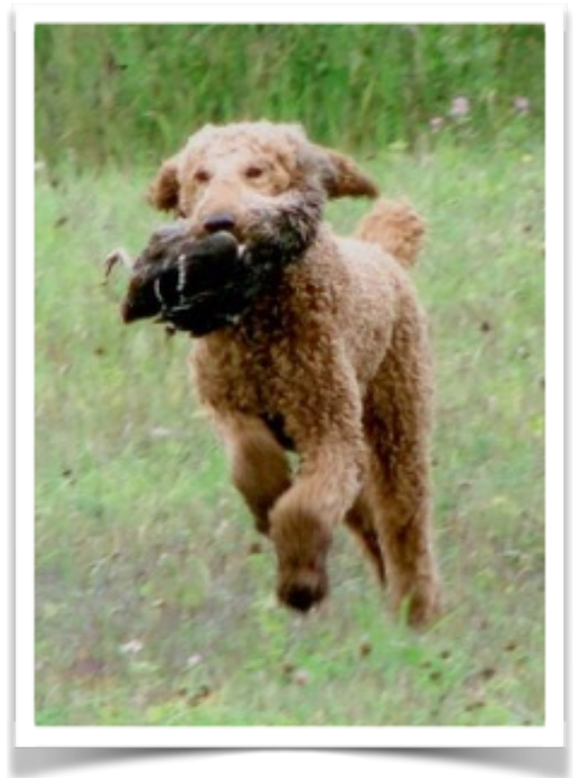
RUSTY - Sire

Puppies ready for their new homes end November 2018