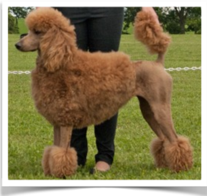
RUBY - Dam