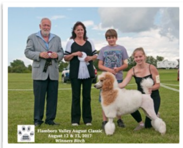
JAZZ - Dam