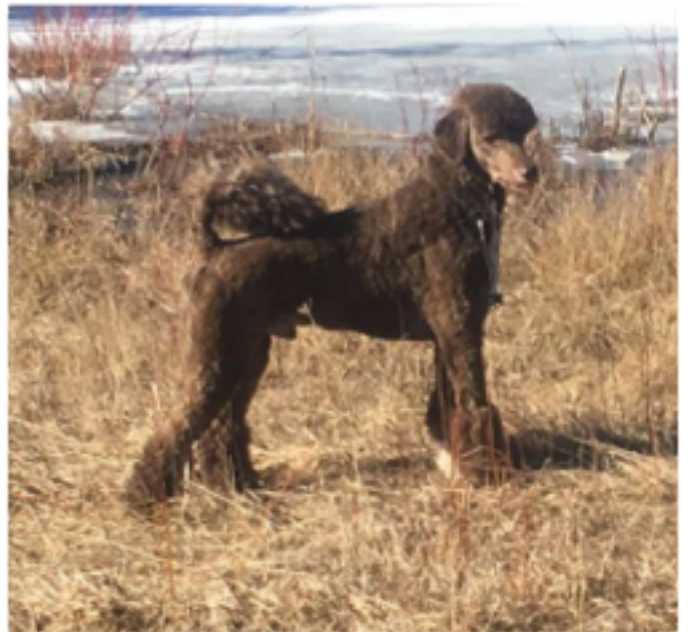
ROMAN - Sire

Puppies ready for their new homes mid November 2018