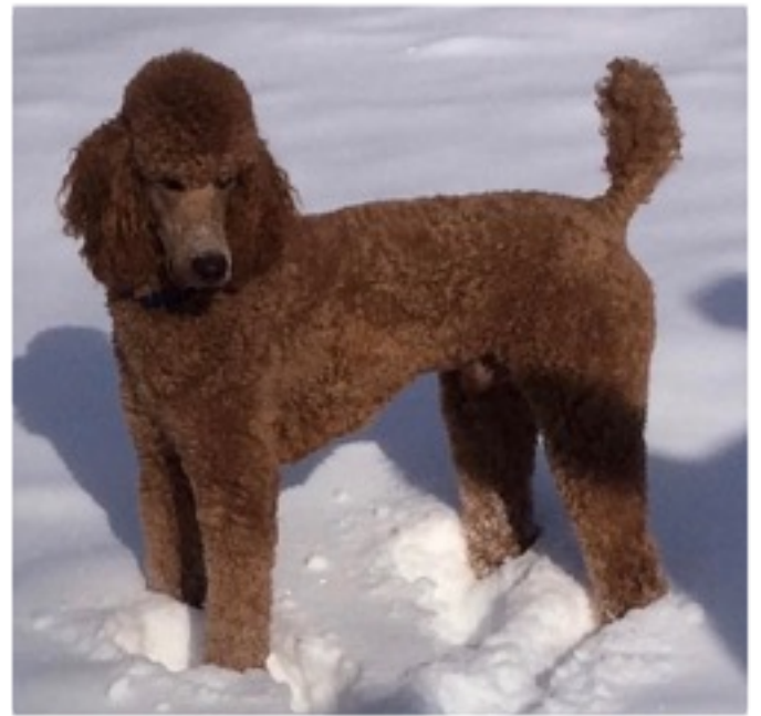
RYDER - Sire

Puppies ready for their new homes late December 2018