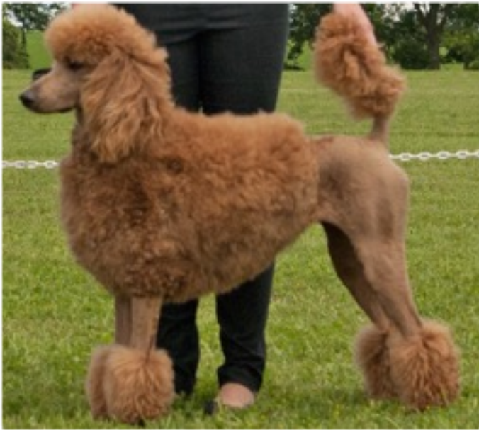
RUBY - Dam

PUPS ANTICIPATED TO ARRIVE Approximately end September 2018 Average Adult Size 40 - 50 pounds