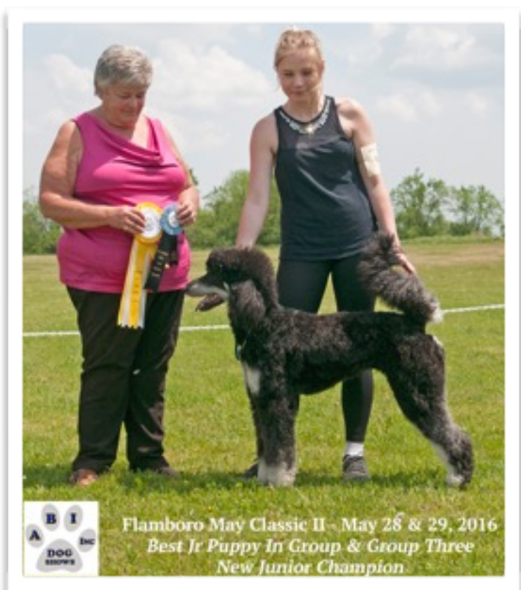
ABBEY M - Dam