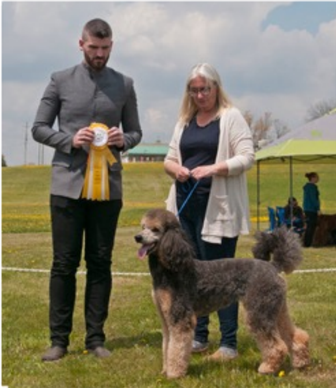
SCOUT - Dam