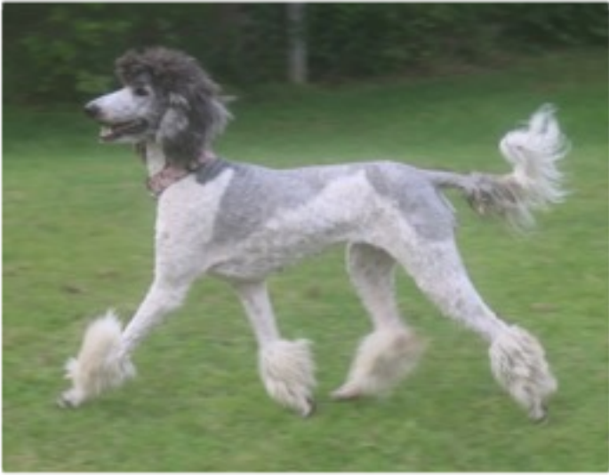
JUPITER - Dam

PUPS ANTICIPATED TO ARRIVE Approximately November 3, 2018 Average Adult Size 45 - 55 pounds