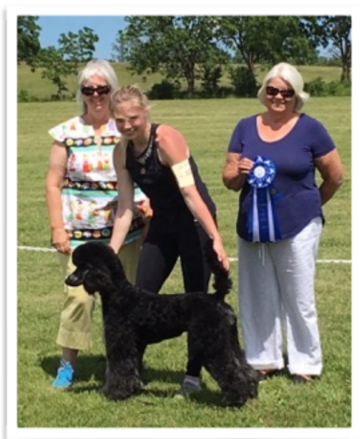
ROCKET - Sire

Puppies ready for their new homes early January 2019