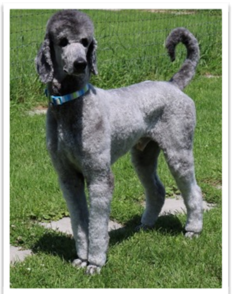
SANDLER - Sire

Puppies ready for their new homes end January 2019