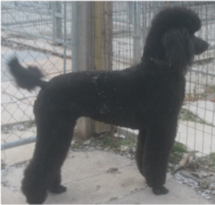
DAKOTA - Dam