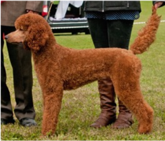
EMBER - Dam