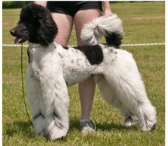
BANDIT - Sire

Puppies ready for their new homes early January 2019