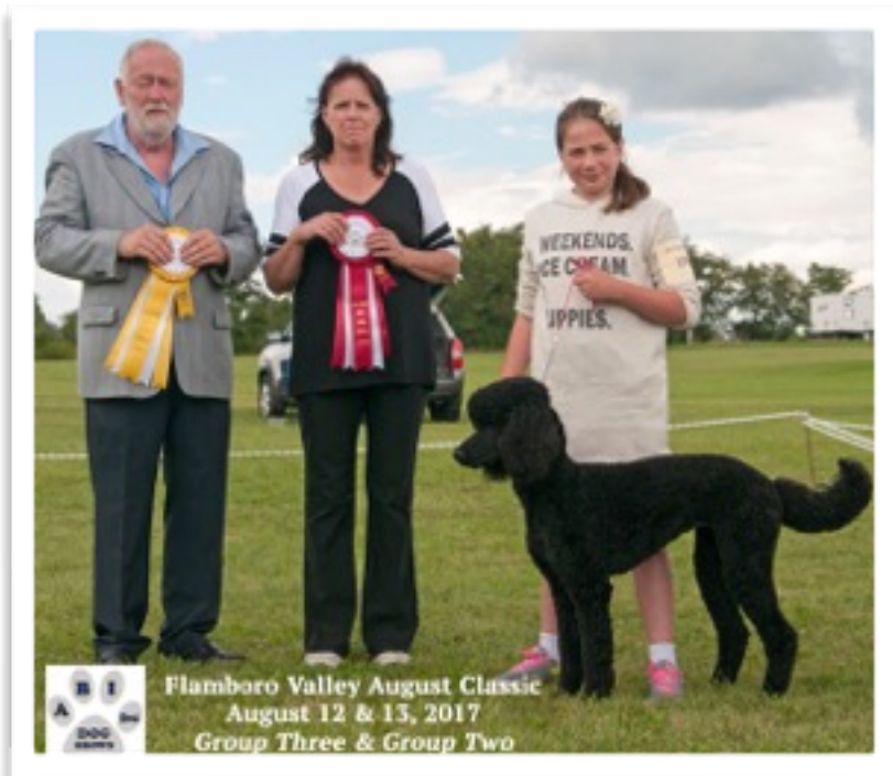
MISCHIEF - DAM