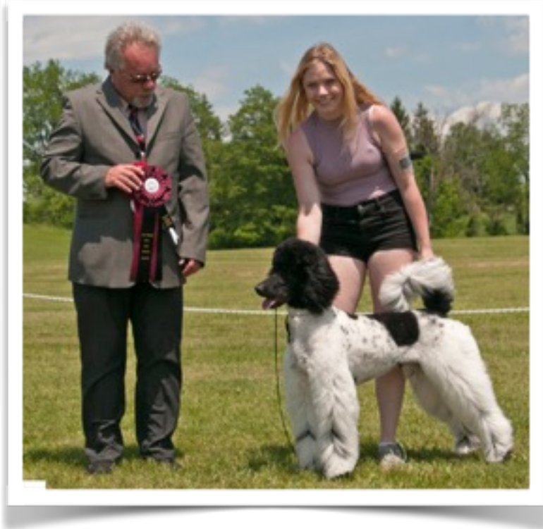
BANDIT - Sire

Puppies ready for their new homes end January 2019