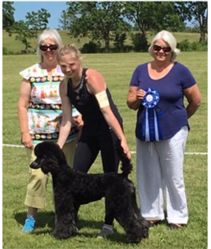
ROCKET - Sire

Puppies ready for their new homes early December 2018