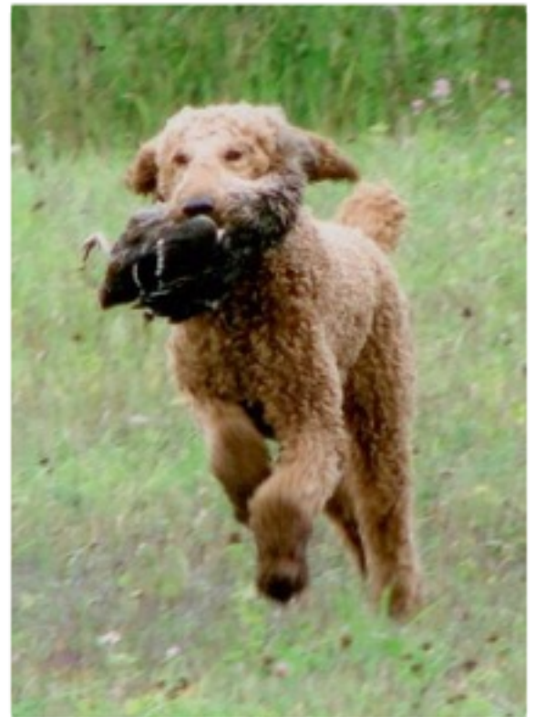
RUSTY - Sire

Puppies ready for their new homes end November 2018