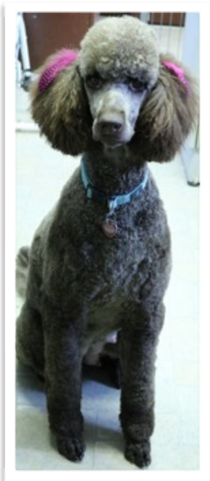
RUE - Dam