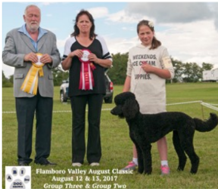
DAKOTA - Dam

PUPS ANTICIPATED TO ARRIVE Approximately MID November 2018 Average Adult Size 40 - 50 pounds